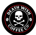
Death Wish Coffee Breakfast Coffee