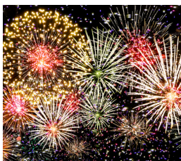
Fireworks sponsored by E & J Gallo Winery