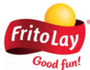
Frito-Lay IGIA Convention Golf Tournament