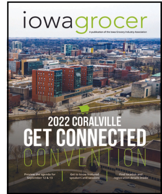
the Iowa Grocer magazine

Luxco Pabst Brewing Company Pan-O-Gold Baking Company Pilgrim's Prairie Farms Reynolds American RollSeal Rose Acre Farms RSM US Ruan Transportation Southern Glazer's Wine & Spirits Sparboe Companies Tyson Foods UNFI Upside Voss Distributing/Red Bull