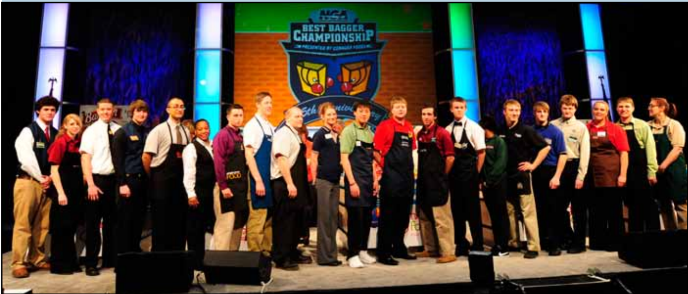
State contestants from the 2011 Championship take time to pose for the camera during orientation.

Monday, February 13, 2012 (subject to change)