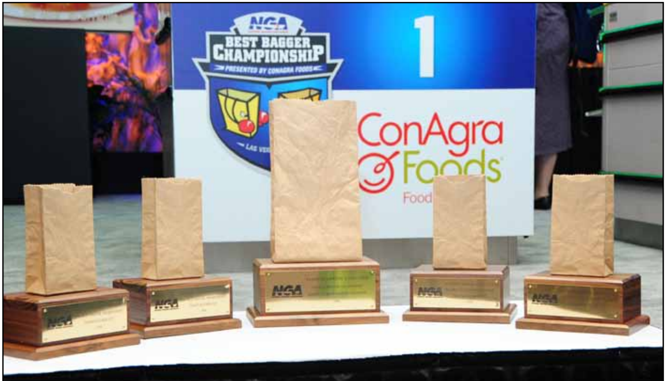
2011 trophies for the champion and four Runners-ups.

time constraints, you may want to have one judge for each check stand you use. With this method, it is imperative to gather your judges in advance and reach a consensus on how to score consistently.