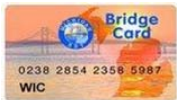
Michigan, Magnetic stripe Card Format

Burger, Carroll, and Associates (BCA) is currently conducting a feasibility and planning study. BCA will present a recommendation to the Iowa WIC Program in the spring of 2012.