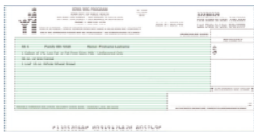
Current Iowa Check Format

A series of informational meetings were conducted during the summer of 2011 beginning with an initial kick-off meeting on June 22, 2011.